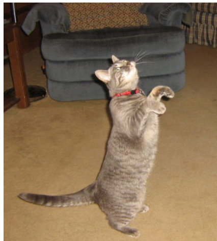
Please pick me up - I want to give my pledge

Here are some selections from her collection. Notice that one of them has a caption. Now here's a game for you: can you come up with church-related captions for the others? If so, send them to the Banner at St. John's e-mail address or drop them off one Sunday.